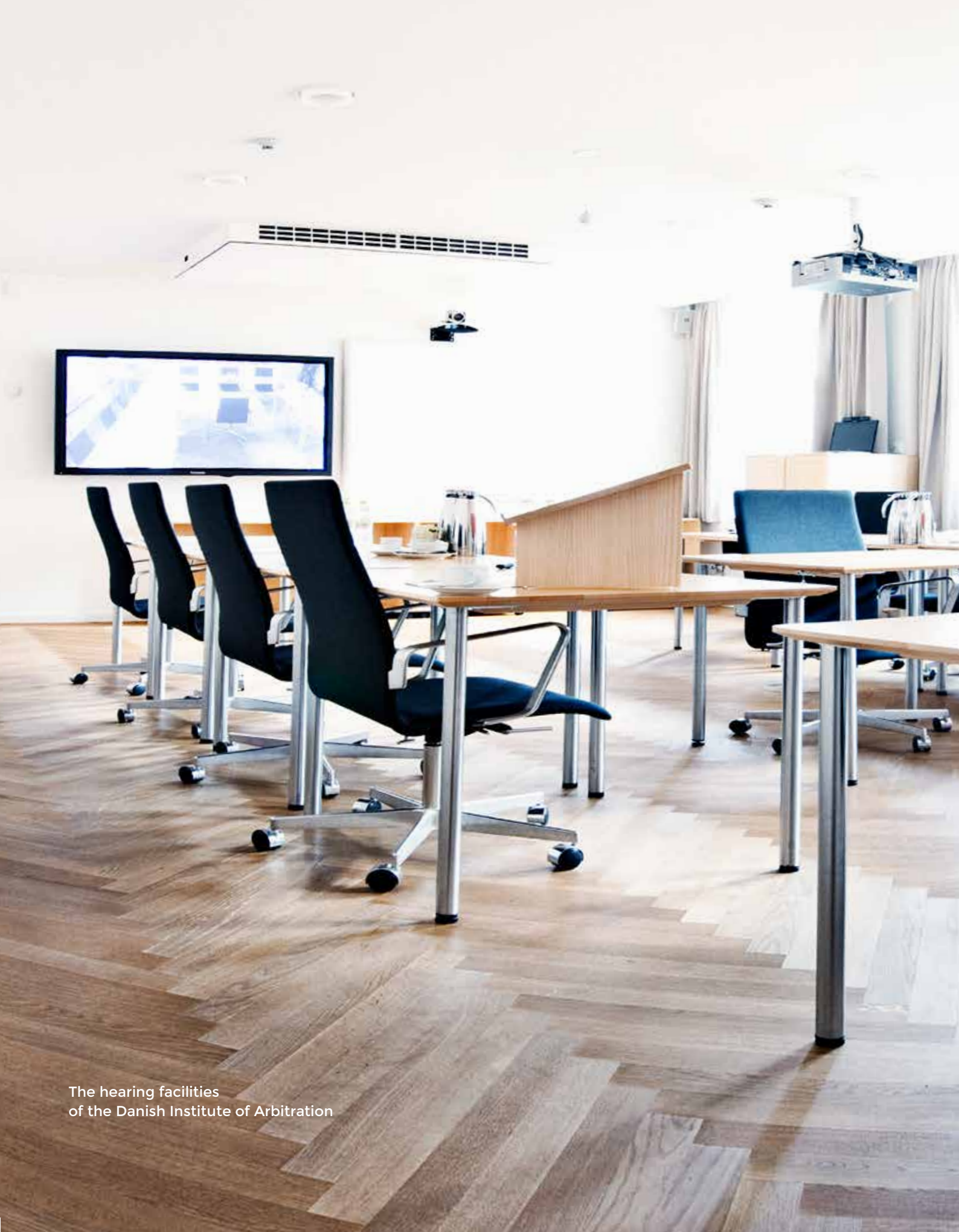
The hearing facilities of the Danish Institute of Arbitration