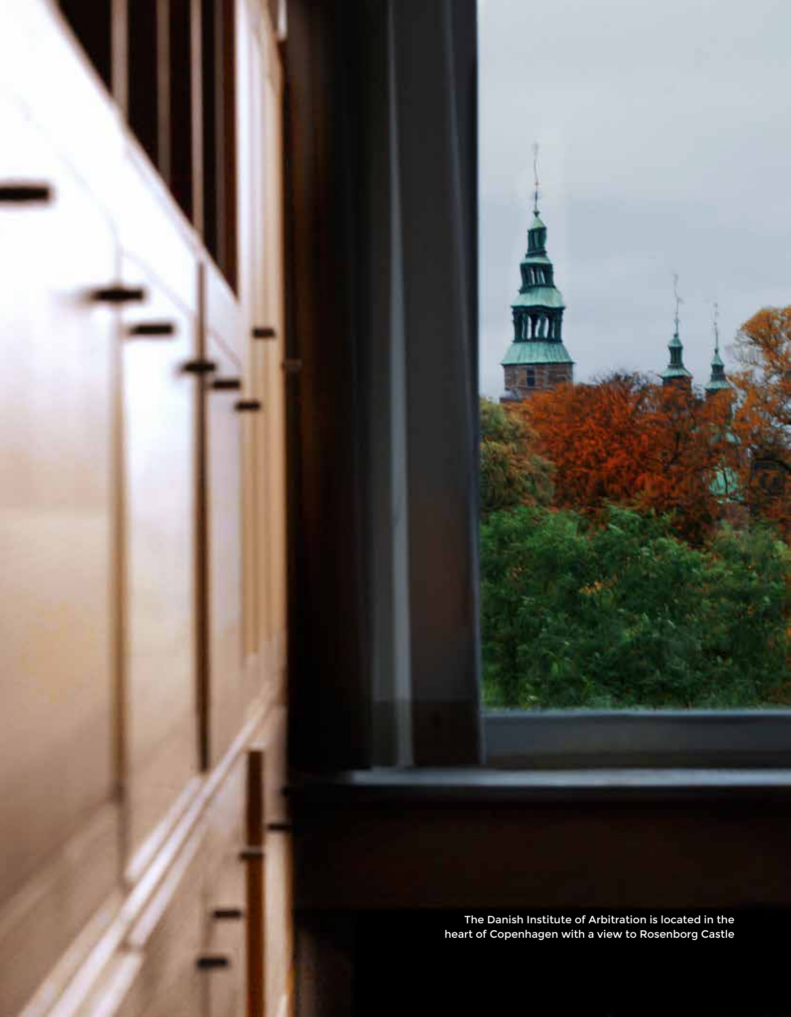
The Danish Institute of Arbitration is located in the heart of Copenhagen with a view to Rosenborg Castle