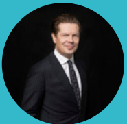
STEFFEN PIHLBLAD SECRETARY GENERAL OF THE DANISH INSTITUTE OF ARBITRATION