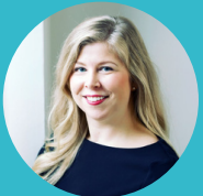
SANNA KAISTINEN SECRETARY GENERAL OF THE FINLAND ARBITRATION INSTITUTE