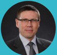
ASKO POHLA CHAIRMAN OF THE COUNCIL OF THE ARBITRATION COURT OF ESTONIAN CHAMBER OF COMMERCE AND INDUSTRY